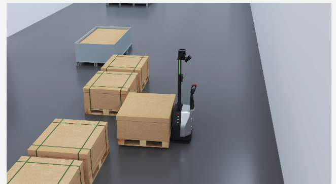
PV Cell Handling