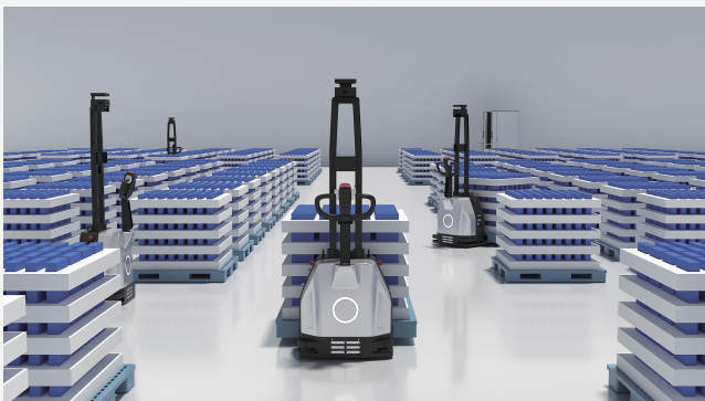
Warehouse & Raw Material Handling of EV Battery