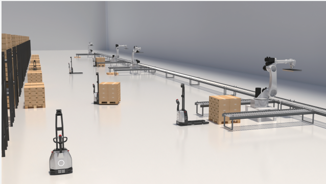
3C Warehouse & Material Handling